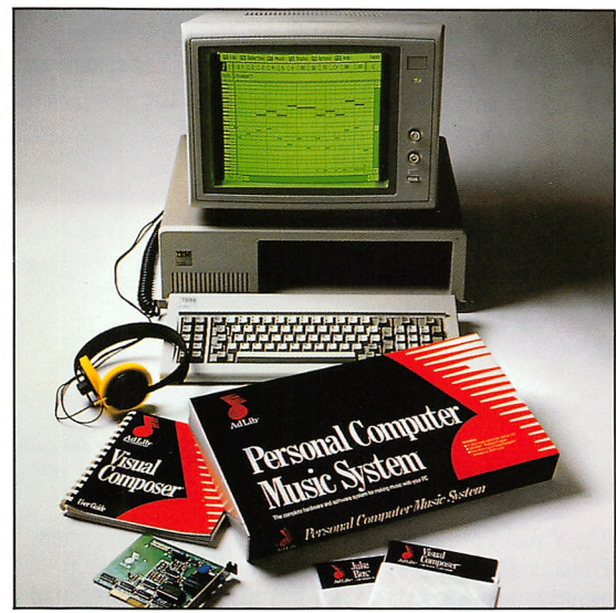
Computerized music has come of age!

If you've always wanted to play around with music, the Ad Lib Personal Computer Music System (PCMS) is for you! Music synthesizers have become creative tools for anyone, just as they can be for you — no matter if you have never touched a musical instrument, no matter what your age.