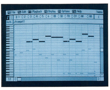
A powerful spreadsheet-like music editor

With Ad Lib Visual Composer you simply draw notes on a spreadsheet-like screen, with the cursor keys, a mouse or a MIDI keyboard. This powerful music editor allows for flexible musical nuances which can be set independently for each note of each of the eleven simultaneous voices.