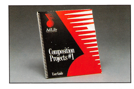
Follow the guide and build your own music!

The Visual Composer package also includes Composition Projects #1, a step-by-step guide to creating music in assorted popular styles. With this manual and associated library of song patterns, you simply follow the guidelines and start building your own songs right away. Styles covered in Composition Project #1 are the following: Ballad, Blues, Swing Jazz, Classical, Boogie Woogie, Ragtime, Bossa Nova and Slow Dance.