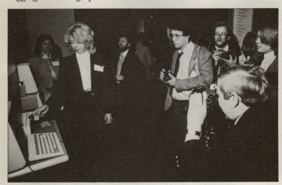
PCjr's introduction turned into a media event rivaling NASA's first moon shot.

We'll know the answers in about a year, but we needn't wait that long to examine IBM's hopes and fears in these matters and perhaps even draw some conclusions about what might have been on Big Blue's mind when it decided to loose its latest computing machine on the public. Along the way we'll touch on such esoterica as price wars, black holes, corporate strategies, and what it takes to become the lowest-cost producer in the world if, in your heart, that's what you really want to be.