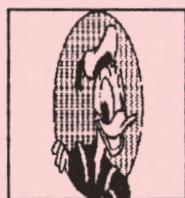
How 'bout them Ducks!!

To Junior Members far and near ... I want to wish you a Happy New Year !!! We had a great time in '94 ... Come on now gang... Let's do it some more!!!