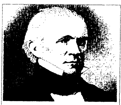
Do you know who this is? (See page 9 for details)

the usefulness of your PCjr depends on your being able to print "hard copy" of what you've created with your spreadsheet or word processor - it doesn't do your kid much good to spend several hours writing that perfect paper if he or she has to take it in for the teacher to read encased in a PCjr, now does it? Anyhow, get a printer first. It's a necessity, not a luxury, and we'll discuss types and levels of printers at another time.