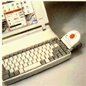
The 84-key keyboard has 12 function keys and responds perfectly to the touch.