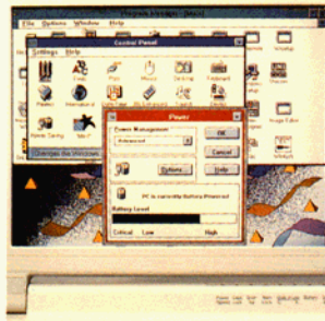
The large, bright screen allows you to take colour with you.