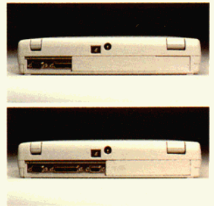
A sliding door is built into the computer case to protect interfaces.