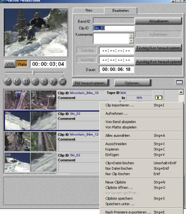
Matrox MediaTools interface and menus in German.